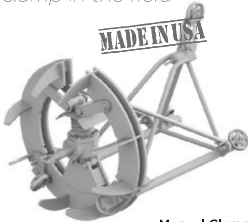
Manual Clamp (241)

Fastest, most reliable clamp in the field