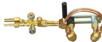
Accessory: Double cutting torch for the preparation of X- and V-shaped welding seams