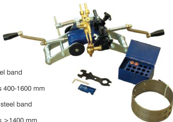
RSV-4 with steel band guidance for pipe diameters 400-1600 mm