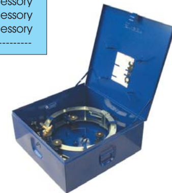
Accessory: Stable steel-plate box for safe storage of the RSV during transport