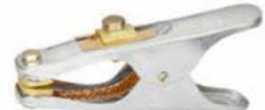
Part No. 1079 Nevada Type Earth Clamp Croc – 500amp Quantity: 1-50