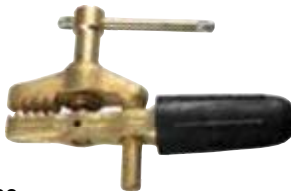
Part No. 1082 Earth Clamp Myking Type – 600amp Quantity: 1-15