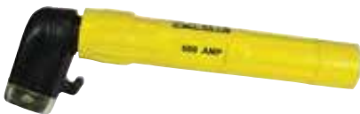
Part No. 1019 LC Twist Type 600amp Yellow Handle Quantity: 10-40