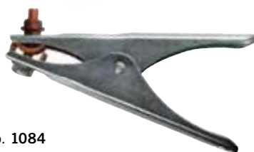
Part No. 1084 Earth Clamp Croc – 400amp Quantity: 1-50