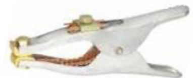
Part No. 1078 Nevada Type Earth Clamp Croc – 350amp Quantity: 1-50