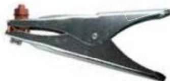
Part No. 1083 Earth Clamp Croc – 200amp Quantity: 1-50