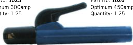
Part No. 1026 Optimum 450amp Quantity: 1-25