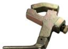
Part No. 1086 Earth Clamp Screw CC11 – 600amp Quantity: 1-20