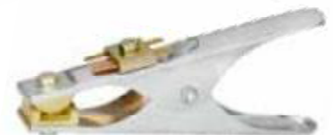
Part No. 1077 Nevada Type Earth Clamp Croc – 250amp Quantity: 1-50