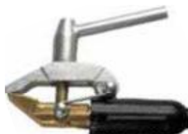
Part No. 1085 Earth Clamp Screw – 600amp Quantity: 1-20