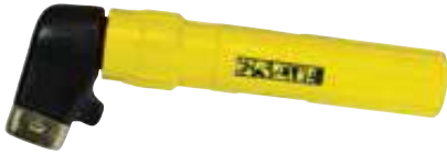
Part No. 1018 LC Twist Type 400amp Yellow Handle Quantity: 10-40