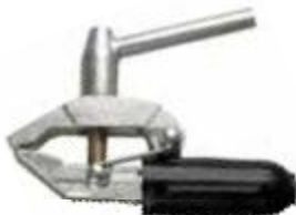
Part No. 1081 Earth Clamp Screw – 600amp Quantity: 1-20