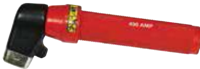
Part No. 1020 Twist Type PG 400amp Red Handle Econ 405 equivalent Quantity: 10-40